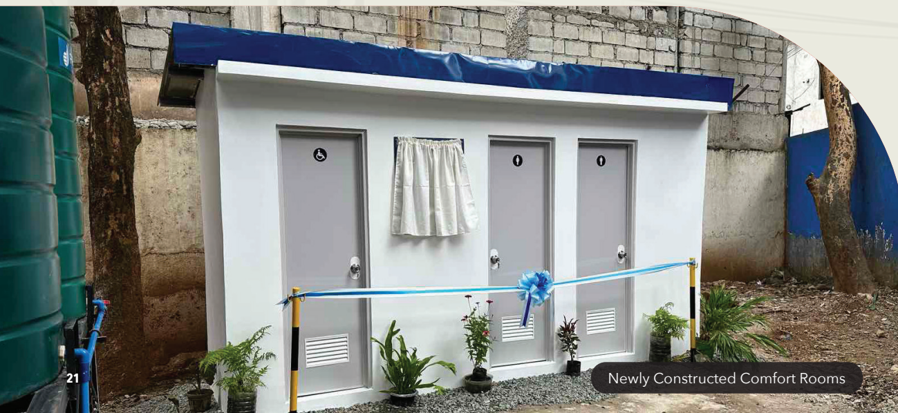
Newly Constructed Comfort Rooms

The Municipality of Taytay is one of Megawide's host communities. This donation shows Megawide Foundation's dedication to improving the quality of life in the areas where the company operates.