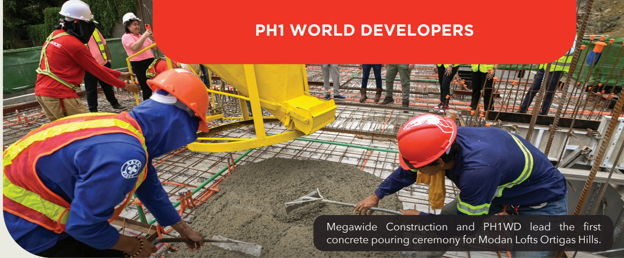
Megawide Construction and PH1WD lead the first concrete pouring ceremony for Modan Lofts Ortigas Hills.