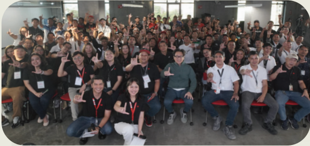
Megawide Construction employees wrap off the Eskwalahan with full pride and joy.