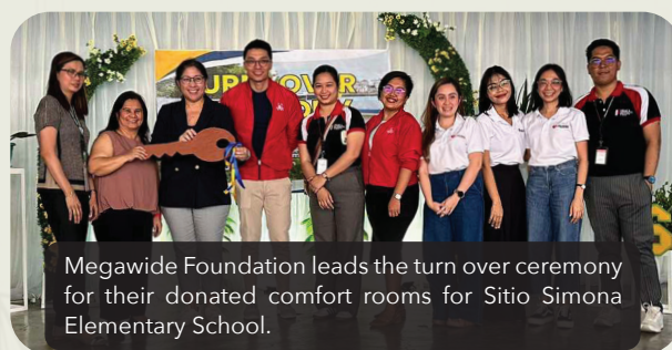
Megawide Foundation leads the turn over ceremony for their donated comfort rooms for Sitio Simona Elementary School.

We led the ceremony and reiterated our mission of empowering communities by addressing essential needs in education and community infrastructure.