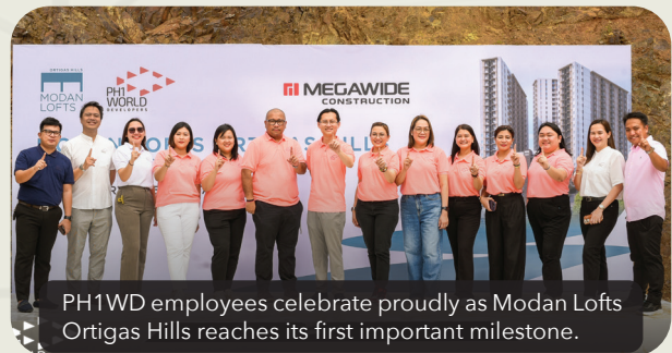
PH1WD employees celebrate proudly as Modan Lofts Ortigas Hills reaches its first important milestone.