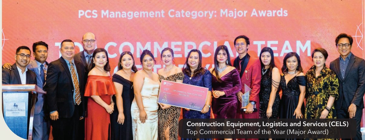
Construction Equipment, Logistics and Services (CELS) Top Commercial Team of the Year (Major Award)