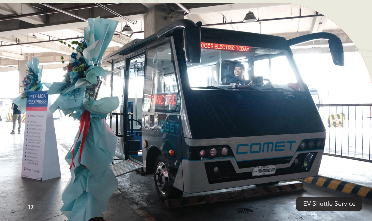
EV Shuttle Service

With this latest innovation, we continue to redefine urban mobility, proving that efficient, eco-friendly, and commuter-centric solutions are the future of public transport in the Philippines.