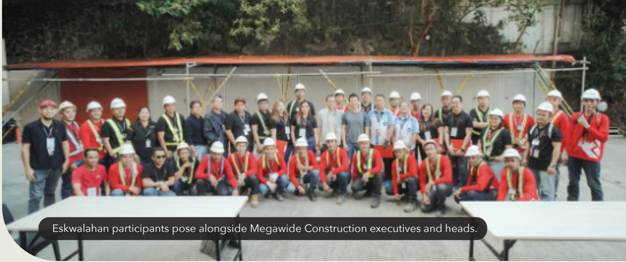
Eskwalahan participants pose alongside Megawide Construction executives and heads.