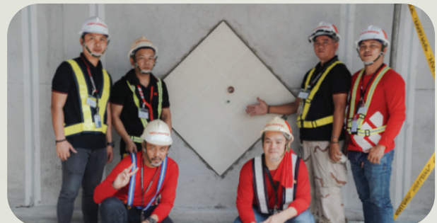
3rd Place: GenSun Dragons