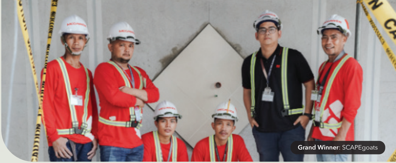
Grand Winner: SCAPEgoats