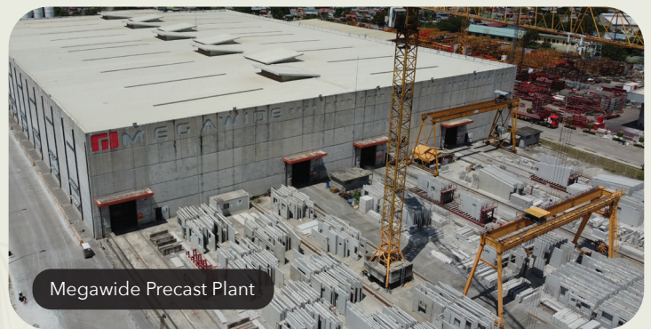
Megawide Precast Plant

Out of the seven local precast manufacturers, Megawide has the largest and most advanced precast facility in the Philippines.