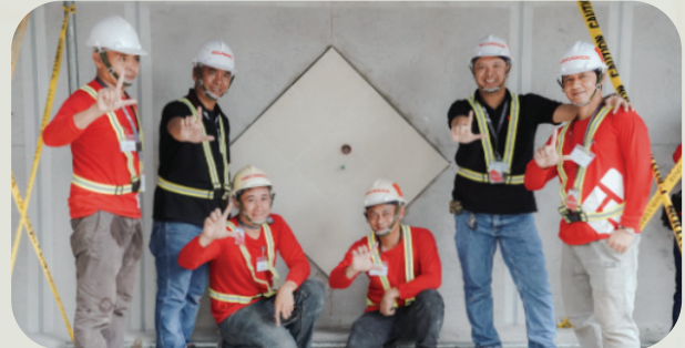
2nd Place: Gentle Giants

In the afternoon, awards were presented to those who excelled in the competition.