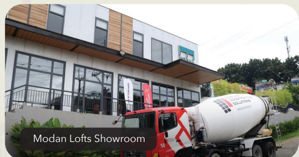
Modan Lofts Showroom