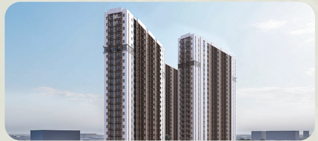
Pasig Project Perspective

Each individual unit will incorporate Megawide's patented "AddLoft Technology" which increases the total volume of livable space by almost 40%, maximizing high ceilings, anchored on an innovative loft design and engineering methodology.