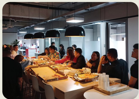
Employees go with fun conversations over good food during the MegaBirthday Bash.