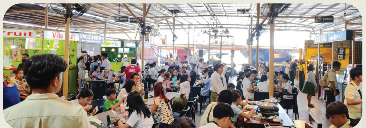
Customers flock to the Barracks exploring and enjoying the variety of Cebu delicacies.

In Cebuano, the local chief executive said the food establishment generated many jobs for individuals, which enabled them to provide for their families, while the development greatly benefited the public.