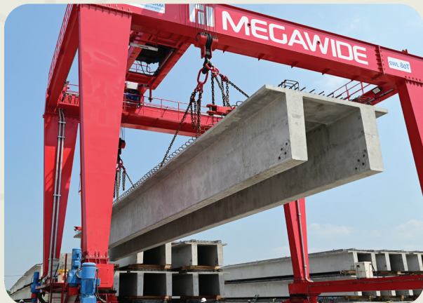
Megawide PCS unit produces precast double-tee girders to supply for the Candaba Viaduct expansion project.

We look forward to serving more developments of these kinds to facilitate commerce and mobility in the nearby regions, while promoting increased activity and productivity, as well as supporting overall economic growth.