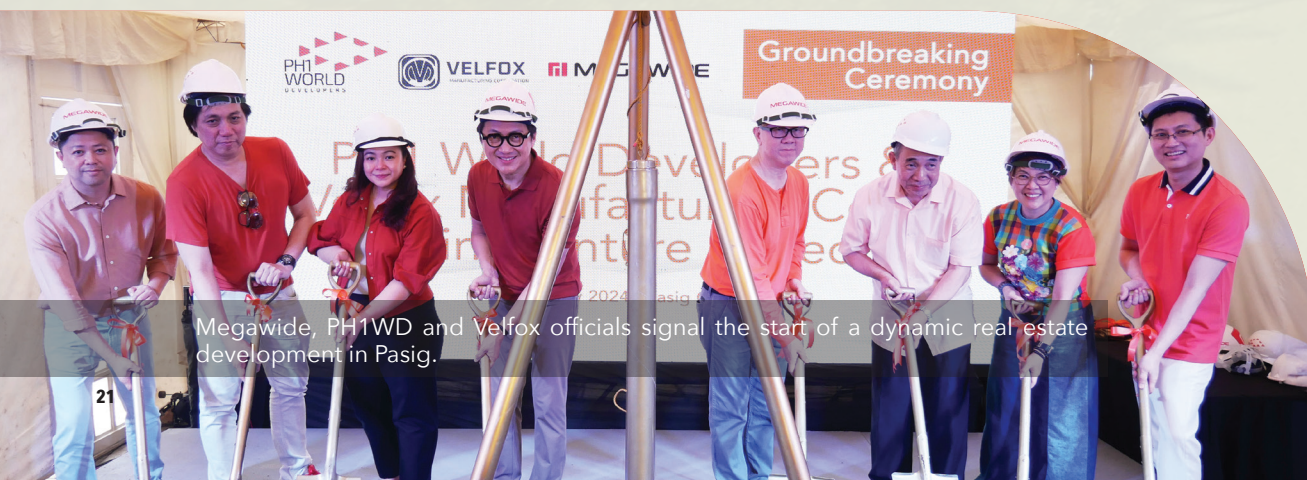
Megawide, PH1WD and Velfox officials signal the start of a dynamic real estate development in Pasig.