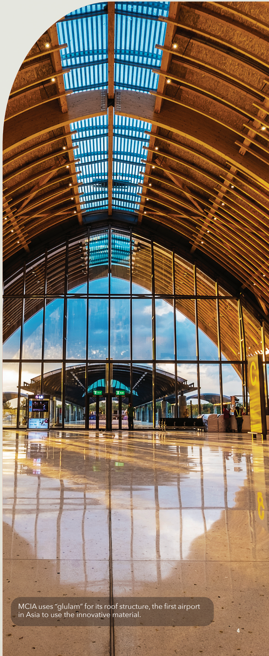
MCIA uses "glulam" for its roof structure, the first airport in Asia to use the innovative material.