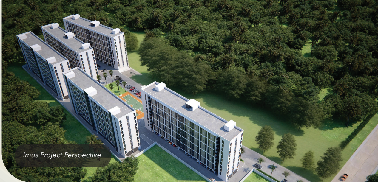
Imus Project Perspective