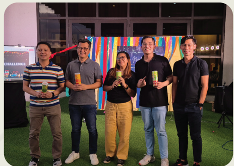
Team A wins exciting prizes after beating Team B in fun games.

As we continue our cultural renewal journey, we celebrate the milestones we have achieved. Increased employee satisfaction and improved collaboration are just a few indicators of our progress. We remain committed to continuous improvement, knowing that a thriving culture requires ongoing effort and dedication.