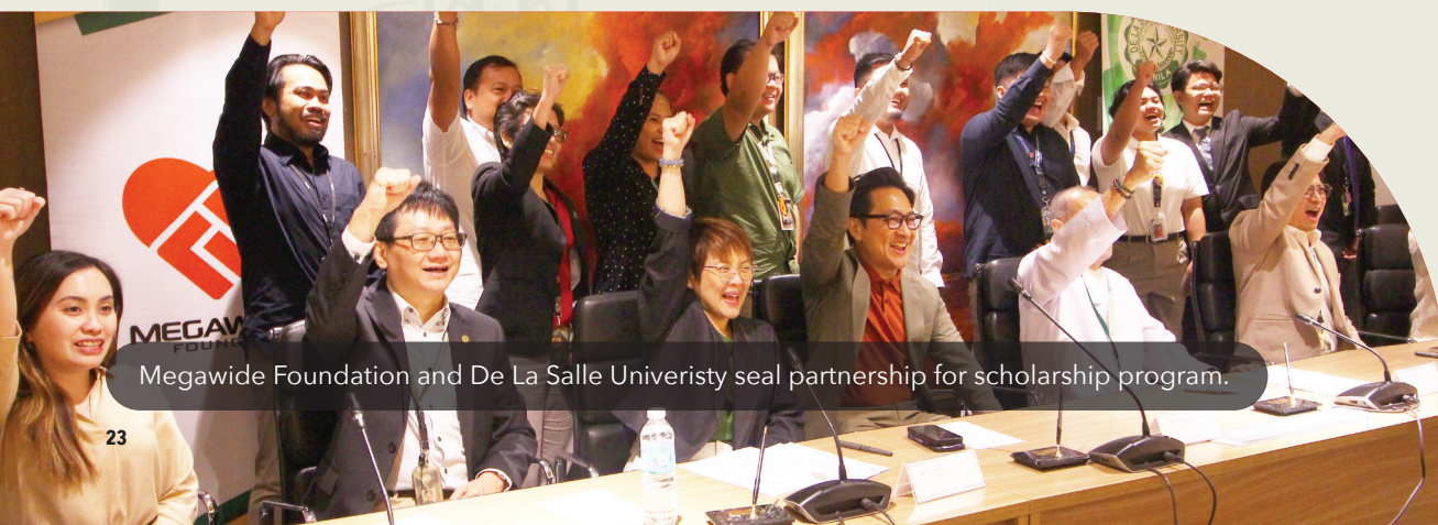
Megawide Foundation and De La Salle University seal partnership for scholarship program.