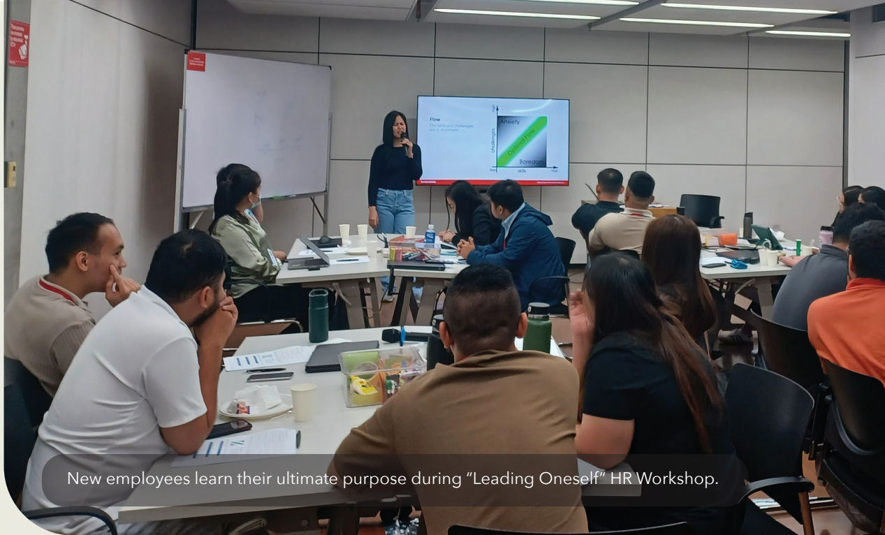
New employees learn their ultimate purpose during "Leading Oneself" HR Workshop.